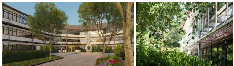
Clyst House will provide office space for a wide range of businesses - boosting the local economy and securing more local employment, with high-specification accommodation in a wide range of sizes.