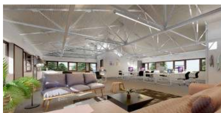
Our Winslade House office spaces will set new standards for greater Exeter.